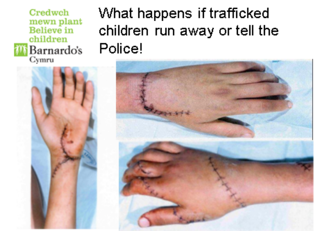
Barnardos Cymru is working with partners to prevent child exploitation