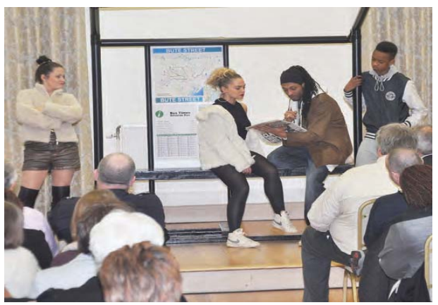
The cast of the play 'SOLD'