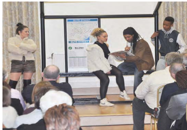
The cast of the play 'SOLD'