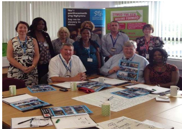
Members of the Wales Anti-Slavery Leadership Group – Training Sub Group